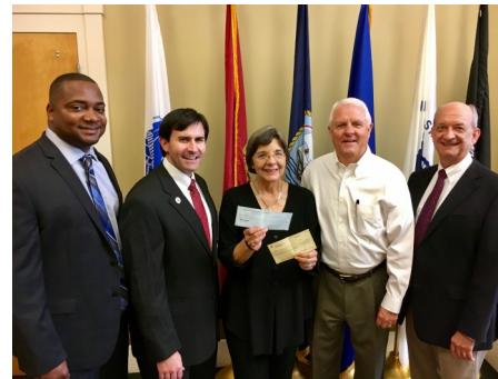
Faithful and generous State Farm Agents presenting a check for classroom teacher grants.